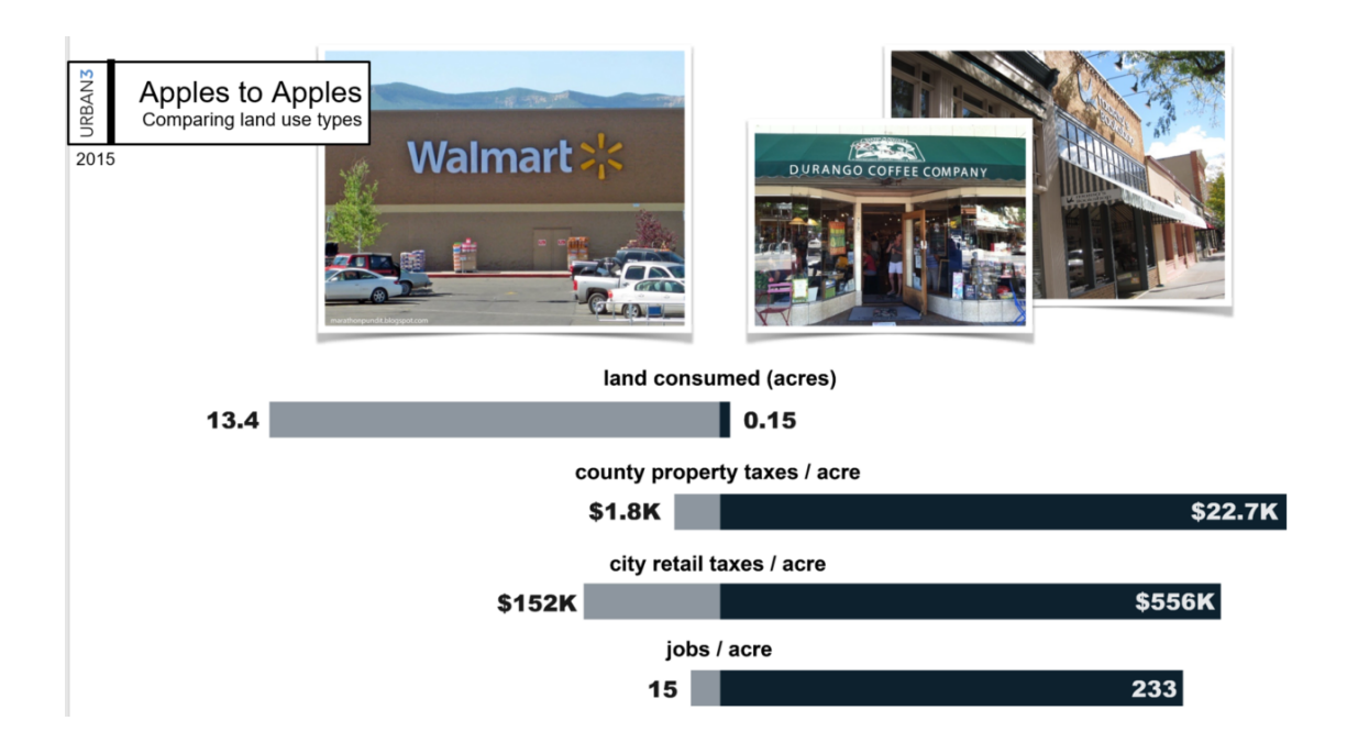
Example: Durango, CO comparison of Walmart vs downtown historic building (Joe Minicozzi presentation)

Commercial development. Colorado communities rely on commercial and industrial development for a revenue base. However, inefficient and dispersed development patterns create a lower level of jobs-per-acre and sales-tax-per-acre than more compact development types. In many cases, historic "main street" areas provide a higher level of taxes and jobs per acre than big-box development while requiring less infrastructure per acre. In order to grow the economic base, local governments often undertake intense jurisdictional competition to chase dispersed commercial uses. However, as the infrastructure ages, commercial development